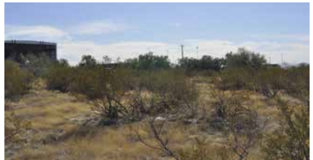
Property facing East