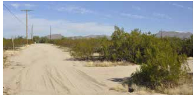
West Line Road

Price and Terms: $735,000. Short Term Seller Financing Possible. Submit.