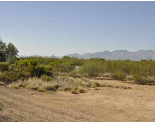
Property View N.W.