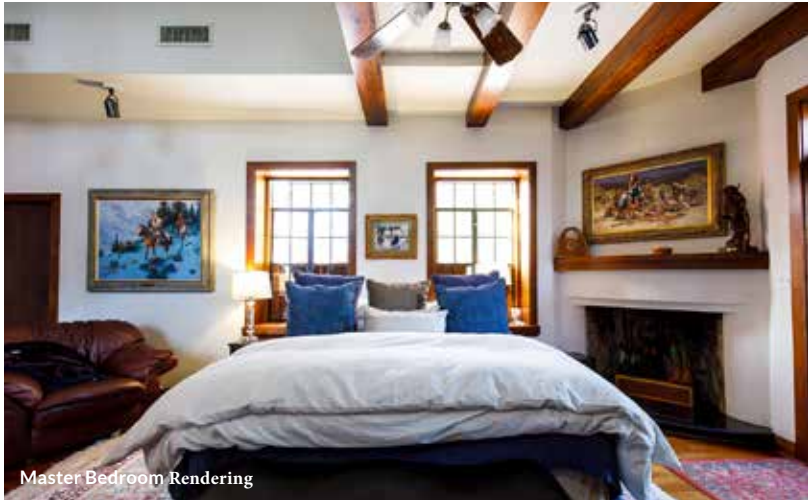
Master Bedroom Rendering