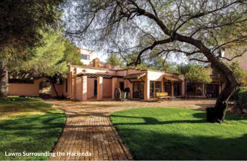
Lawns Surrounding the Hacienda